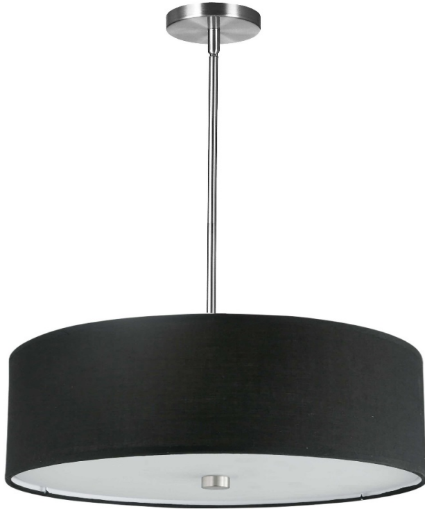
4 Light Incandescent Pendant Polished Chrome with Black Shade